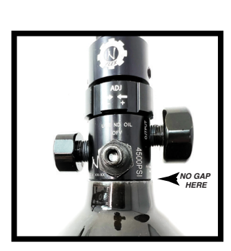
ASTM Safety Vent Groove